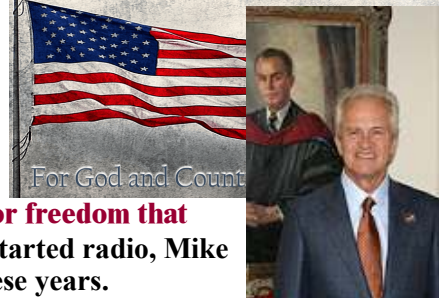
For God and Country