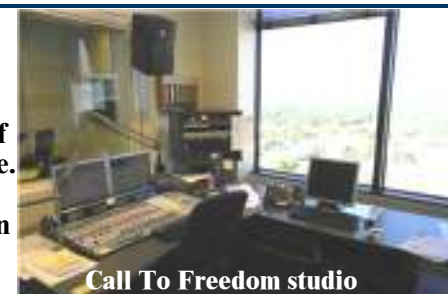
Call To Freedom studio