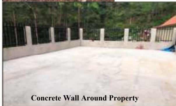
Concrete Wall Around Property